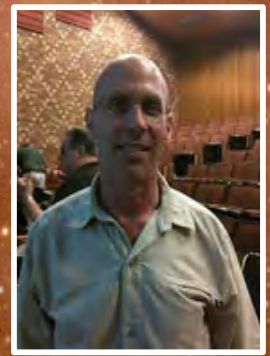
Tom Field RSpec – Real Time Spectroscopy